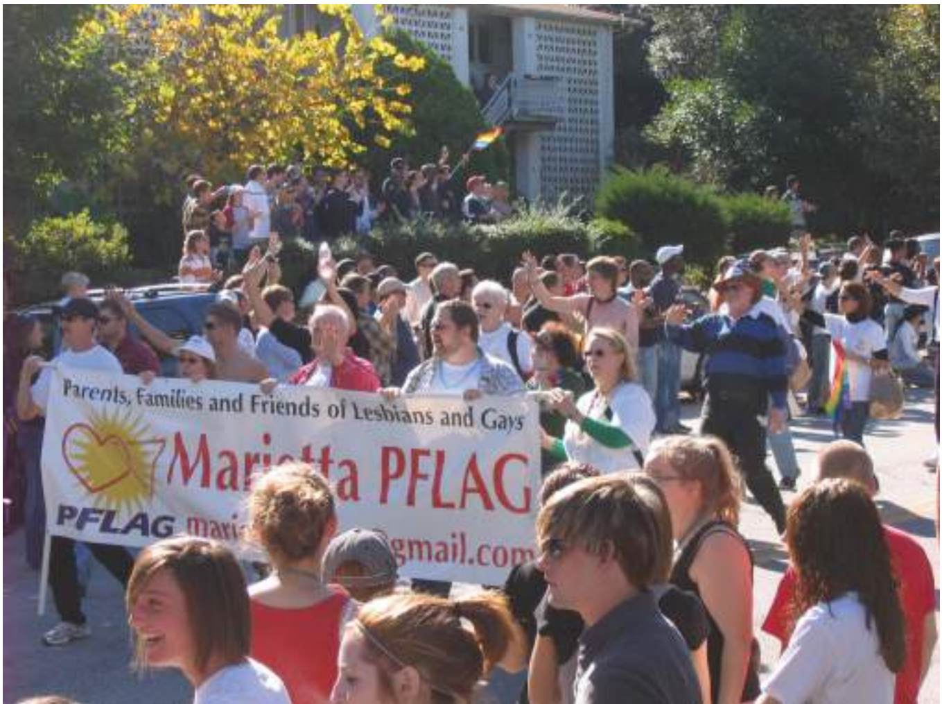
Figure 1.2.4: Heterosexual people with gay family members or friends may join the group PFLAG (Parents, Families, and Friends of Lesbians and Gays) as a part of the redefinition and/or integration stage of their dominant identity development.

Knowing more about various types of identities and some common experiences of how dominant and nondominant identities are formed prepares us to delve into more specifics about why difference matters.