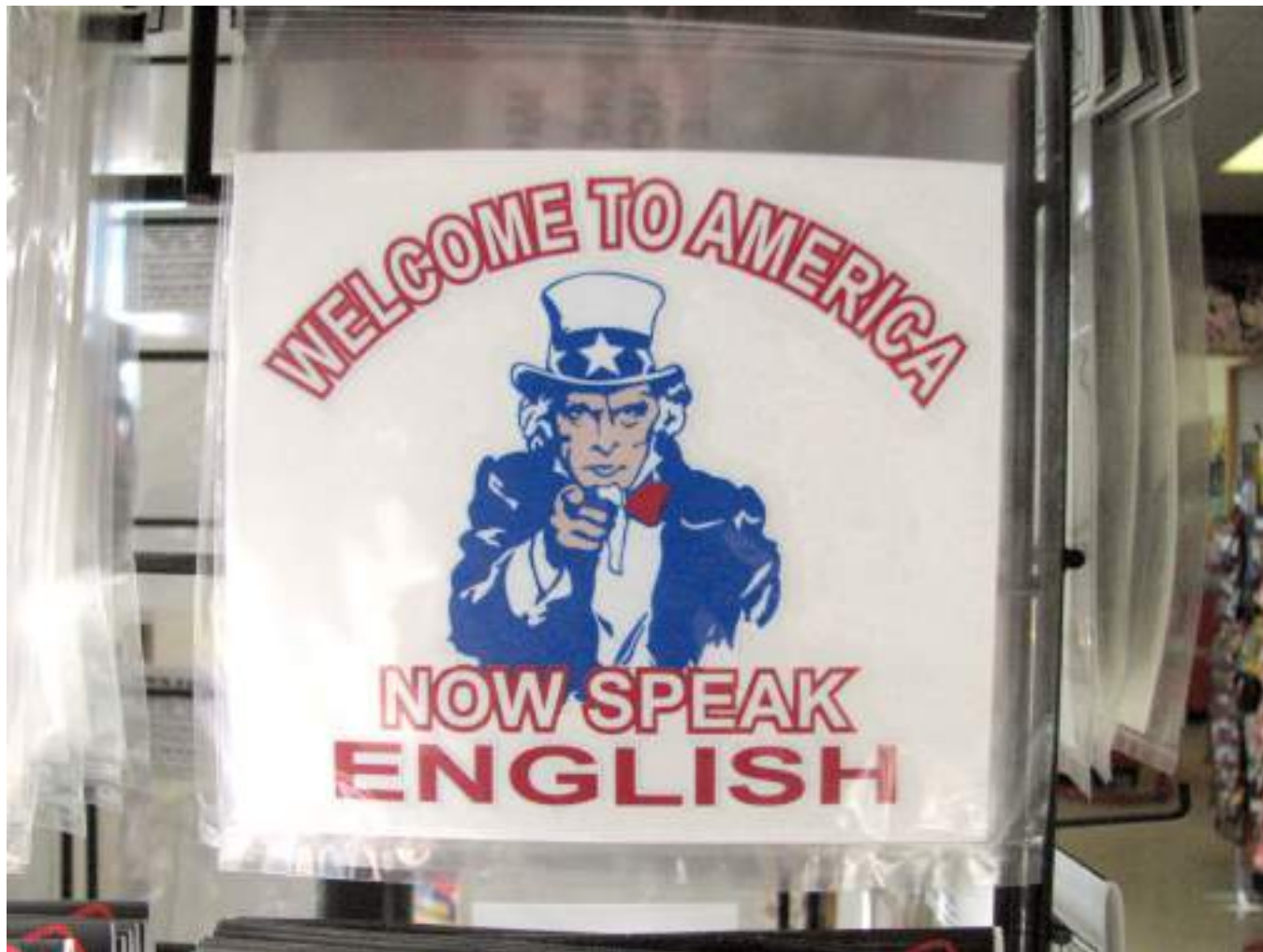
Figure 1.3.2: The “English only” movement of recent years is largely a backlash targeted at immigrants from Spanish-speaking countries.

Another national controversy has revolved around the inclusion of Spanish in common language use, such as Spanish as an option at ATMs, or other automated services, and Spanish language instruction in school for students who don't speak or are learning to speak English. As was noted earlier, the Latino/a population in the United States is growing fast, which has necessitated inclusion of Spanish in many areas of public life. This has also created a backlash, which some scholars argue is tied more to the race of the immigrants than the language they speak and a fear that white America could be engulfed by other languages and cultures (Speicher, 2002). This backlash has led to a revived movement to make English the official language of the United States.