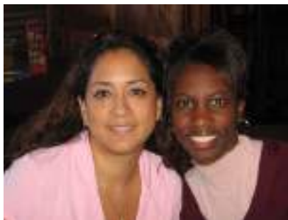
Figure 1.3.1: There is actually no biological basis for racial classification among humans, as we share 99.9 percent of our DNA.

Would it surprise you to know that human beings, regardless of how they are racially classified, share 99.9 percent of their DNA? This finding by the Human Genome Project asserts that race is a social construct, not a biological one. The American Anthropological Association agrees, stating that race is the product of “historical and contemporary social, economic, educational, and political circumstances” (Allen, 2011). Therefore, we'll define race as a socially constructed category based on differences in appearance that has been used to create hierarchies that privilege some and disadvantage others.