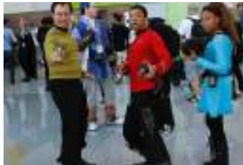
Figure 1.1.2: Trekkies (or fans of Star Trek) are a subculture; they share specific understandings and meanings that those outside their subculture may not understand.

Now that you have a better understanding of culture and what it entails, lets briefly discuss co-cultures.