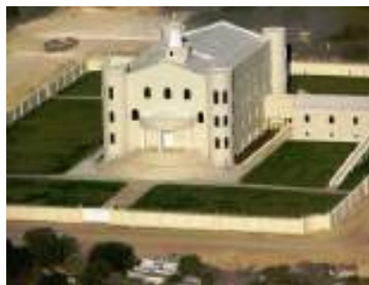
Figure 1.1.: The Fundamentalist Church of Jesus Christ of Latter-Day Saints (or FLDS), advocates the practice polygamy, making members part of a countercultural group (polygamy is illegal in the United States). FLDS Eldorado by Randy Mankin is in the public domain.

A subculture is a culture shared and actively participated in by a minority of people within a broader culture. A culture often contains numerous subcultures. Subcultures incorporate large parts of the broader cultures of which they are part, but in specifics they may differ radically. Some subcultures achieve such a status that they acquire a name of their own. Examples of subcultures could include: bikers , military culture , Bronies , and Star Trek fans (trekkers or trekkies) .