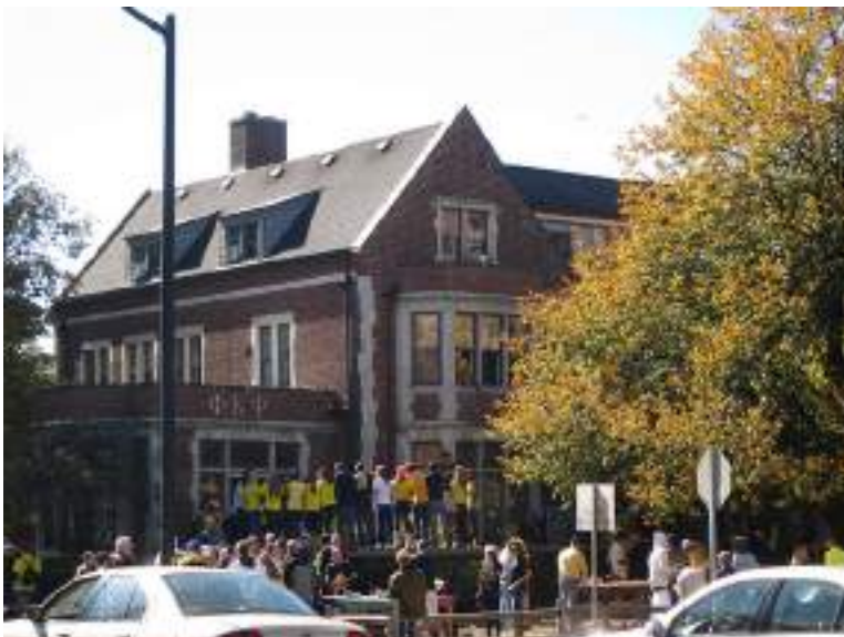
Figure 1.2.1: Pledging a fraternity or sorority is an example of a social identity.

We must avoid the temptation to think of our identities as constant. Instead, our identities are formed through processes that started before we were born and will continue after we are gone; therefore our identities aren’t something we achieve or complete. Two related but distinct components of our identities are our personal and social identities (Spreckels, J. & Kotthoff, H., 2009). Personal identities include the components of self that are primarily intrapersonal and connected to our life experiences. For example, I consider myself a puzzle lover, and you may identify as a fan of hip-hop music. Our social identities are the components of self that are derived from involvement in social groups with which we are interpersonally committed.