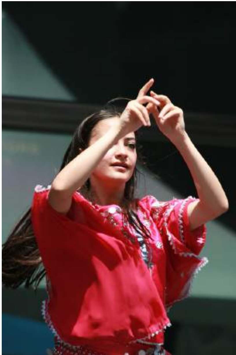
Figure 1.2.3: Many hearing-impaired people in the United States use American Sign Language (ASL), which is recognized as an official language. Quinn Dombrowski – ASL interpreter – CC BY-SA 2.0.

While this is not a separatist movement, a person who is hearing impaired may find refuge in such a group after experiencing discrimination from hearing people. Staying in this stage may indicate a lack of critical thinking if a person endorses the values of the nondominant group without question.