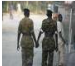
Figure 1.1.1: In many parts of Africa and the Middle East, it is considered normal for men to hold hands in friendship. How would Americans react to these two soldiers?

When people go against a society’s values, they are punished. A boy who shoves an elderly woman aside to board the bus first may receive frowns or even a scolding from other passengers. A business manager who drives away customers will likely be fired. Breaking norms and rejecting values can lead to cultural sanctions such as earning a negative label—lazy, no-good bum—or to legal sanctions, such as traffic tickets, fines, or imprisonment.