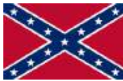
Figure 6.2: There has been controversy over whether the Confederate flag is a symbol of hatred or a historical symbol that acknowledges the time of the Civil War. Jim Surkamp – Confederate Rebel Flag – CC BY-NC 2.0.

The history/past-present/future dialectic reminds us to understand that while current cultural conditions are important and that our actions now will inevitably affect our future, those conditions are not without a history. We always view history through the lens of the present. Perhaps no example is more entrenched in our past and avoided in our present as the history of slavery in the United States.