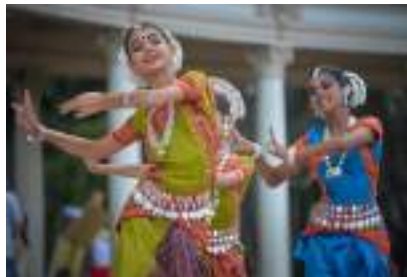
Figure 1.4.1: Three Indian woman performing a native dance. By pavan gupta

“When you begin to understand the biology of human variation, you have to ask yourself if race is a good way to describe that.”—Janis Hutchinson, Biological Anthropologist