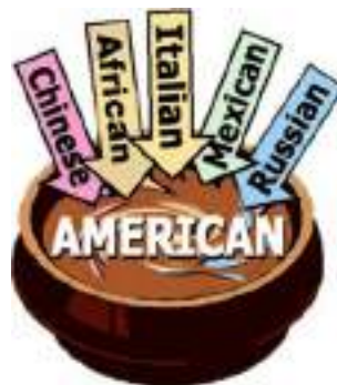
Figure 1.7.1: The American Melting Pot. Source .

The Melting Pot Metaphor- "is a metaphor for a heterogeneous society becoming more homogeneous , the different elements "melting together" into a harmonious whole with a common culture. It is particularly used to describe the assimilation of immigrants to the United States ; the melting-together metaphor was in use by the 1780s."