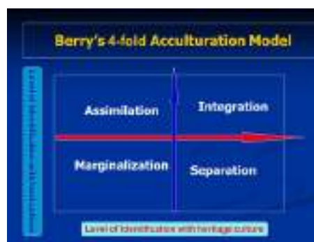
Figure 1.7.2: 4-Fold Acculturation Model.

Acculturation is the process by which immigrant people adjust and adapt their way of life to the host culture. Once in the U.S., they realize that they have to make some adjustments in order to experience success in their daily interactions with members of the mainstream society.