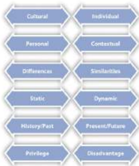
Figure 6.1: Dialectics of Intercultural Communication. Source: Adapted from Judith N. Martin and Thomas K. Nakayama, "Thinking Dialectically about Culture and Communication," Communication Theory 9, no. 1 (1999): 1–25.

The cultural-individual dialectic captures the interplay between patterned behaviors learned from a cultural group and individual behaviors that may be variations on or counter to those of the larger culture. This dialectic is useful because it helps us account for exceptions to cultural norms. For example, earlier we learned that the United States is said to be a low-context culture, which means that we value verbal communication as our primary, meaning-rich form of communication. Conversely, Japan is said to be a high-context culture, which means they often look for nonverbal clues like tone, silence, or what is not said for meaning. However, you can find people in the United States who intentionally put much meaning into how they say things, perhaps because they are not as comfortable speaking directly what's on their mind. We often do this in situations where we may hurt someone's feelings or damage a relationship. Does that mean we come from a high-context culture? Does the Japanese man who speaks more than is socially acceptable come from a low-context culture? The answer to both questions is no. Neither the behaviors of a small percentage of individuals nor occasional situational choices constitute a cultural pattern.