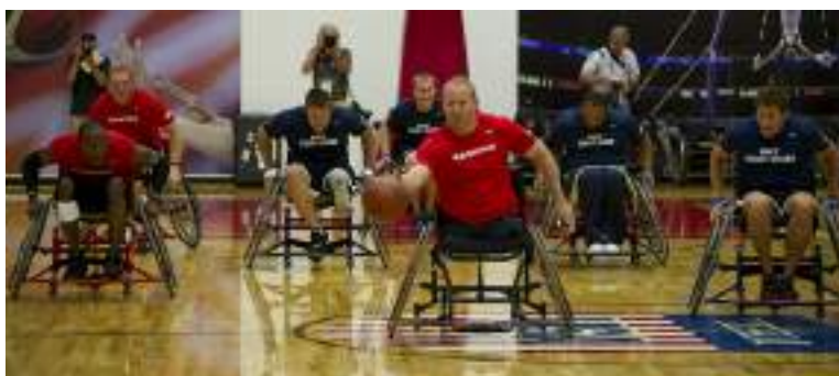
Figure 1.3.3: As recently disabled veterans integrate back into civilian life, they will be offered assistance and accommodations under the Americans with Disabilities Act.

Statistically, people with disabilities make up the largest minority group in the United States, with an estimated 20 percent of people five years or older living with some form of disability (Allen, 2011). Medical advances have allowed some people with disabilities to live longer and more active lives than before, which has led to an increase in the number of people with disabilities. This number could continue to increase, as we have thousands of veterans returning from the wars in Iraq and Afghanistan with physical disabilities or psychological impairments such as posttraumatic stress disorder.